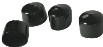
VINYL LEG CAPS