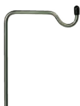
SINGLE HOOK IV POLE