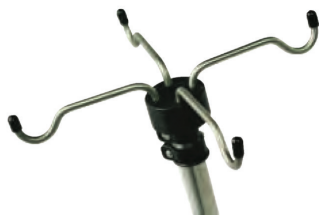
FOUR HOOK IV POLE