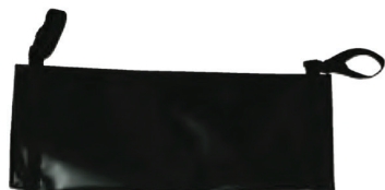
OXYGEN BOTTLE HOLDER