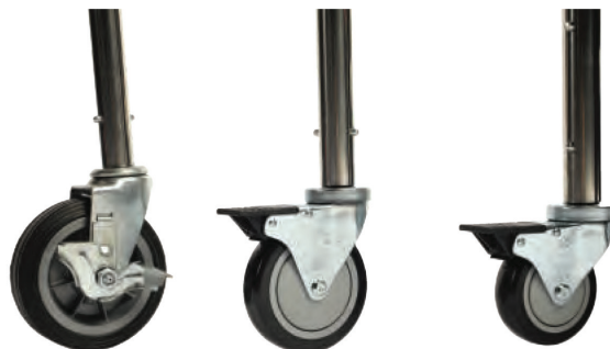
6", 5" (standard), 4" CASTERS (from left to right)